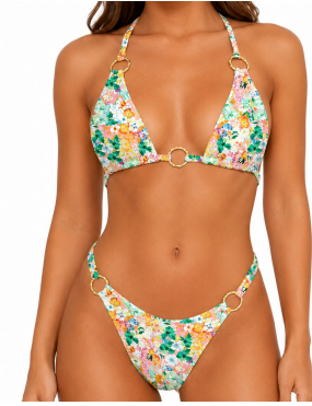
Printed Bikini Set